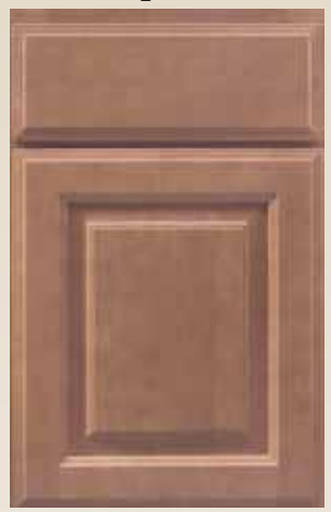
Species Available: Poplar