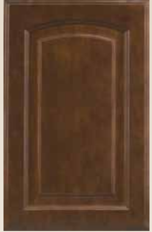
Species Available: Poplar