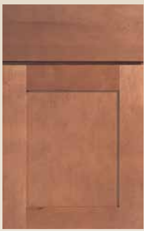
Species Available: Maple Oak