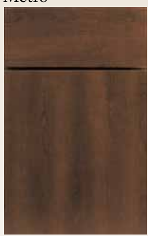
Species Available: Laminate

Home Concepts meets the increasing demand for accessible living and aging-in-place environments in today's homes with The Active Living Collection. The addition of new cabinets gives you the product you need to meet your clients' changing needs. Please refer to Wellborn's Active Living flyer for design ideas.