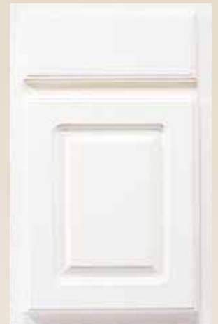
Species Available: Thermofoil