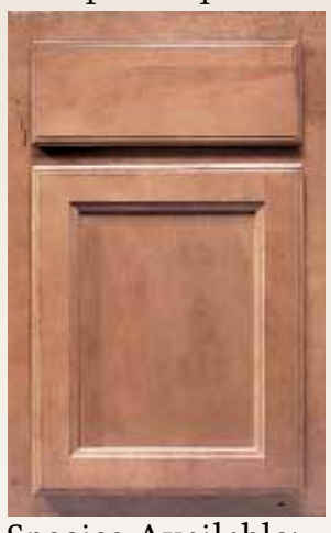
Species Available: Maple Oak