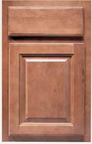
Species Available: Maple Oak