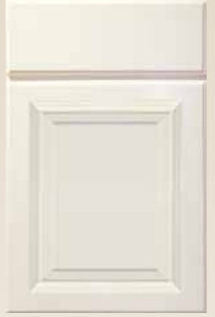
Species Available: MDF