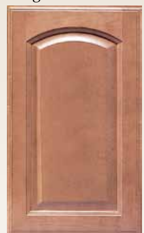
Species Available: Maple Oak