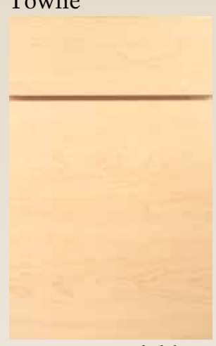
Species Available: Laminate